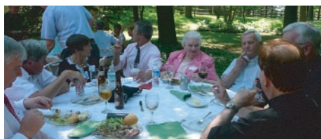
Food, Folks, and Fun